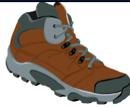
Sturdy Enclosed Footwear